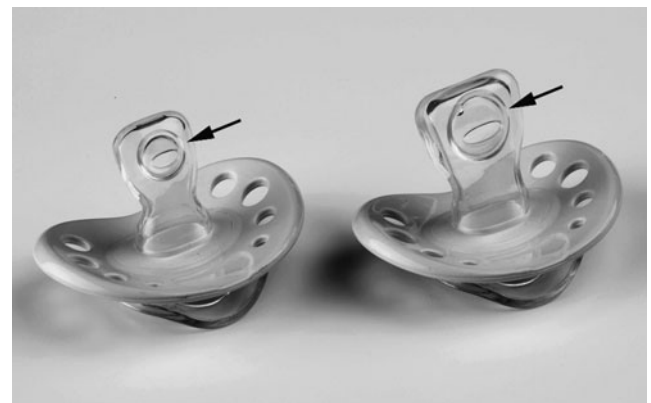
Fig. 2. The novel slow-release pacifier with pouch (↑).